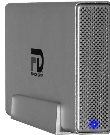
Disk Activity/Power Indicator Light (Blue)